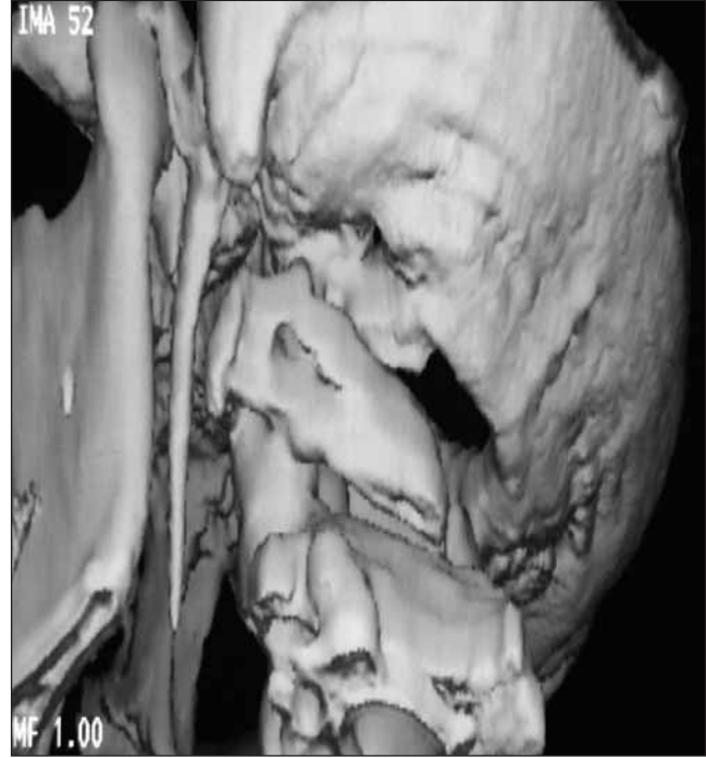
Figure 1. Three-dimensional reconstruction of computed tomography showing left elongated styloid process.

During surgery; elongated styloid process was clearly visualized on the left tonsillar fossa after ton-