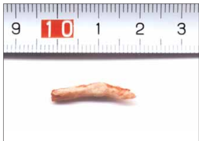
Figure 2B. Partially resected styloid process. [Color figure can be viewed in the online issue, which is available at www.turkarchotolaryngol.org ]