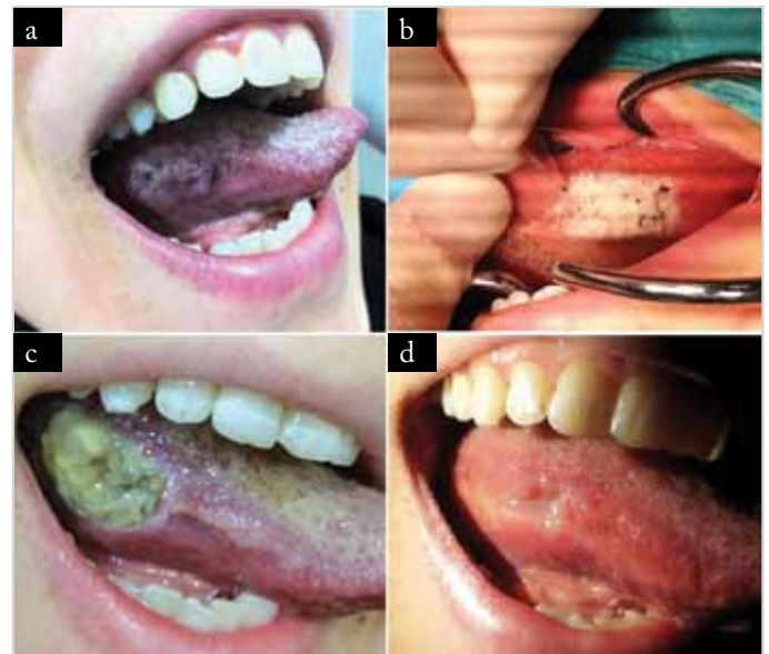
Figure 2. Case 2 (a) preoperative (b) intraoperative (c) postoperative tenth day (d) postoperative first month