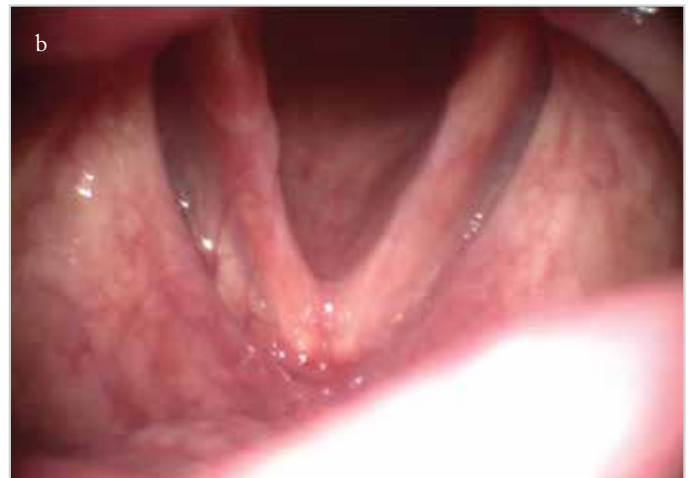
Figure 3. a, b. Endoscopic appearance in the postoperative third month (a), endoscopic appearance in the postoperative ninth month (b)

have been described (5). The cause of cutaneous verruca vulgaris is generally reported as type 2 HPV and type 4 HPV. However, HPV subtypes have been studied in a patient diagnosed with laryngeal verruca vulgaris in literature, and contrary to the type 2 and 4, which are frequently observed in cutaneous verruca vulgaris, HPV positivity has been found in type 6 and 11 (5). HPV positivity could not be demonstrated in the other two cases reported in the literature (3, 4). HPV was studied immunohistochemically in our patient, and low- or moderate-risk HPV positivity was not found. Verruca vulgaris was diagnosed considering the histopathological features of the lesion. Differential diagnoses in the histopathological examination should include keratosis, squamous papilloma, verrucous hyperplasia, and verrucous carcinoma (2). Koilocytosis observed in verruca vulgaris is important in the histopathological differentiation between verruca vulgaris and simple keratosis. Furthermore, in contrast to laryngeal verruca vulgaris, different degrees of atypia can be observed in keratosis.