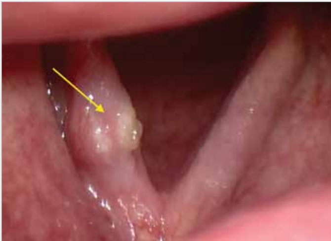
Figure 1. Mass lesions with nodular appearance located in the middle one-third of the right vocal cord