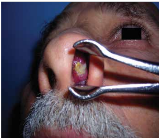
Figure 1. Renal cell carcinoma metastasis developed in the caudal portion of nasal septum

apy was planned, and the patient was referred to the Department of Medical Oncology. At this stage informed written consent was obtained from the patient for an scientific publication.