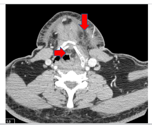
Figure 2. Neck CT, axial section showing abscess foci extending to the larynx (arrows)