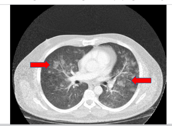
Figure 3. NPPE thoracic CT axial image (arrows) NPPE: Negative pressure pulmonary edema, CT: Computed tomography

As the patient did not benefit from the oxygen administered via the cannula, decision was made to apply invasive mechanical ventilator (IMV) through the tracheostomy cannula, furosemide infusion for diuresis, and empirical meropenem treatment were started. A control CT was taken 48 hours after the patient's oxygen saturation reached 90%, and it was determined that the abscess foci in the parapharyngeal space of the neck continued and the ground glass appearance of the lung regressed but did not completely disappear. The patient was once more taken to the operating room for abscess drainage. Postoperatively, he was connected to an IMV with the recommendation of the pulmonology department. After three days of IMV, the patient's oxygen saturation improved and his pulmonary symptoms regressed.