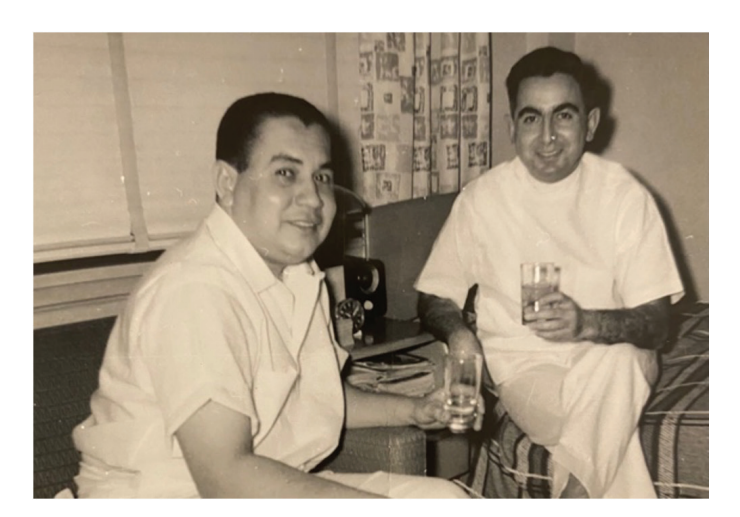
Figure 1. Residency, Washinghton D.C USA