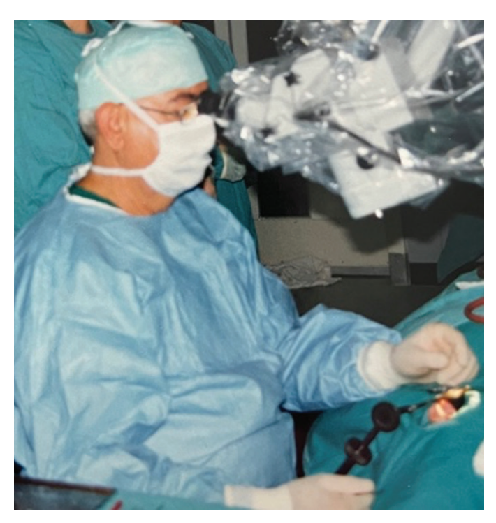
Figure 4. The last stapedectomy performed on the day of retirement at Hacettepe University